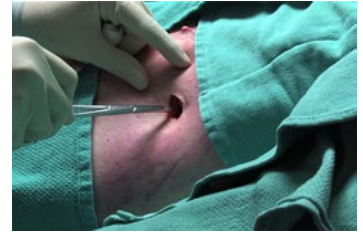
Figure 2. Dissection.

The most important complications associated with chest-tube insertion 1-3,9 include bleeding and hemothorax due to intercostal artery perforation, perforation of visceral organs (lung, heart, diaphragm, or intraabdominal organs), perforation of ma-